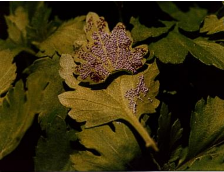
Slime Mold on underside of chrysanthemum leaf