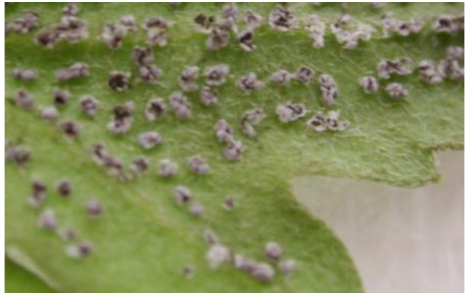
Slime Mold on underside chrysanthemum leaf with most fruiting bodies erupted

Slime Molds do not infect plants but they blemish them by growing on the surface of plants