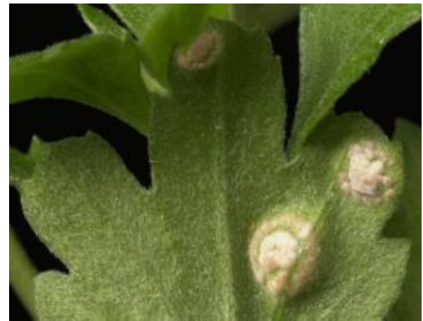
■ CWR caused by Puccinia horiana